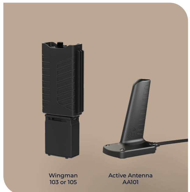
Wingman 103 or 105